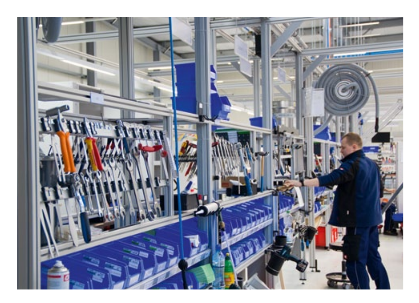
Based on sophisticated series devices ULT AG provides adapted solutions for extraction and filtration technology.