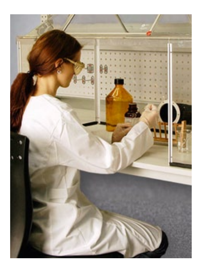
Space-saving mobile ACD type units can be utilised at laboratory work places.

Low noise level and low energy consumption. Simple operation and maintenance. Recirculation operation possible. Easy and contamination low filter exchange.